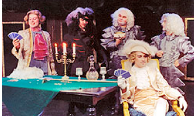
A Dream Play by August Strindberg, 2005