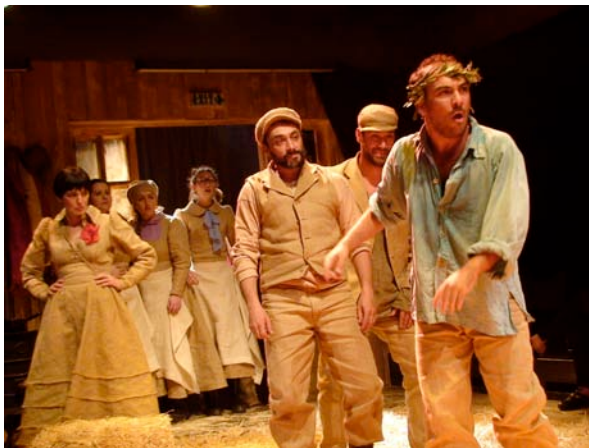
The Cherry Orchard by Anton Chekhov, 2009-2010